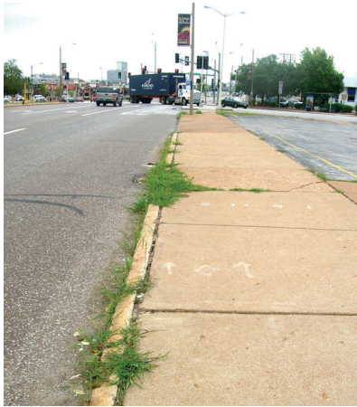
Before Weed Abatement

To continue the beautification of the area, every Spring the Grove CID installs plants to the street's existing planters. The Grove CID provides watering 3 times a week to the planters during the spring and summer months. In addition, the Grove CID provides weed abatement once a month to the streets and sidewalks within the CID boundaries.