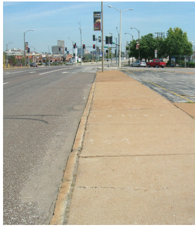
After Weed Abatement