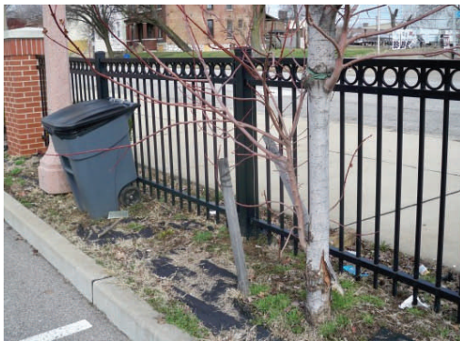
Parking Lot at Sarah and Manchester – Before

There are 2 public parking lots within the district's boundaries. In September, 2010 the Grove CID Board of Directors passed a resolution to pick up the litter and debris and also maintain the parking lot's mulch and landscaping. Once a month a landscaping crew performs weed abatement, spreads mulch as needed, and prunes trees and plants. Every Monday and Friday, the Grove CID maintenance crew removes litter and debris from the 2 lots.