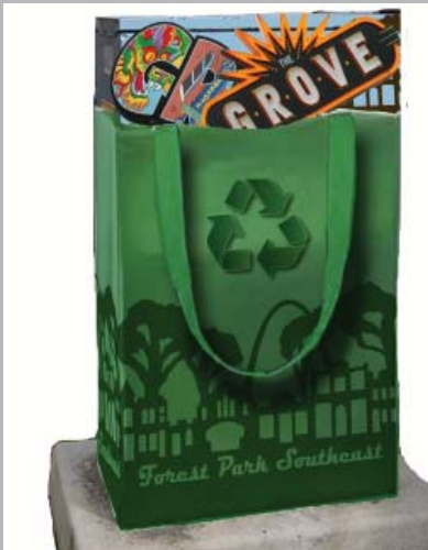
Design: Grace McCammond

Even though there is already an impressive collection of public art throughout Forest Park Southeast, it hasn't stopped people preparing to install more!