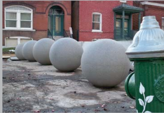
Hydrants: Grace McCammond, Bollards: Wausau Tile

Much of the public infrastructure we see on a daily basis is dull and ordinary. Those things come to life though in Forest Park Southeast. Painted fire hydrants, unique concrete bollards, and soon-to-be-installed modern trash cans, bike racks and planters all spruce up public spaces. Additionally, three new art pedestals have been installed on Manchester to serve as display spaces for more public art!