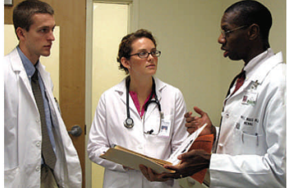
A physician reviews a case with medical students at the Saturday health clinic