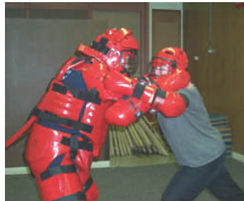
Self Defense Training

Washington University Medical Center 4400 Chouteau St. Louis, MO 63110